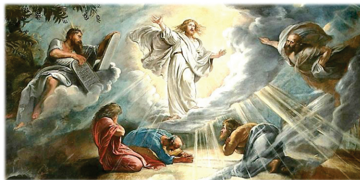
Luke 9:28b-36 ♦ Jesus is transfigured in the presence of Peter, John, and James

“Eternal rest grant unto them, O Lord, and let perpetual light shine upon them. May they rest in peace. Amen.”